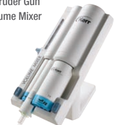
©2009 Kerr Corporation. Lit. No. 34087A All trademarks are property of their respective owners.