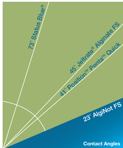
Internal data. Available upon request.

As traditional alginates benefit from inherent hydrophilicity, alginate alternatives must behave the same way. AlgiNot breaks the surface tension of intraoral fluids and displaces them to register outstanding detail. And with superior elasticity, AlgiNot rebounds from deformation far better than traditional alginates—or even other alternatives—to produce an impression that is a true negative replication of the dentition.